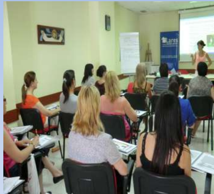
Training courses in LARES C.V. 2012-06-13 LARES